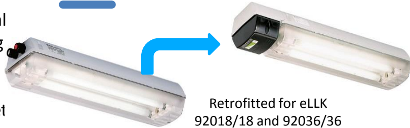
Retrofitted for eLLK 92018/18 and 92036/36

Fabricom undertakes complex industrial onshore and offshore services involving multidisciplinary competencies.